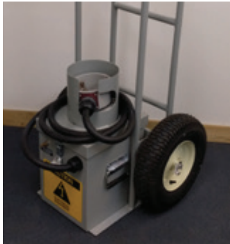
Model SS20M-LW with Heavy Duty Cart