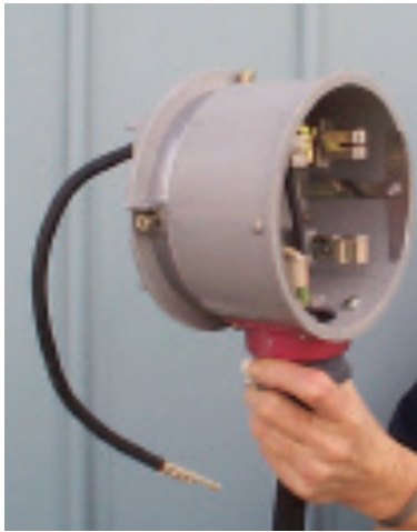
Meter Adapter with Neutral Pigtail